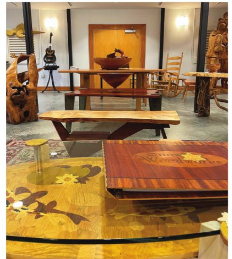
2023 World of Wood Exhibition.