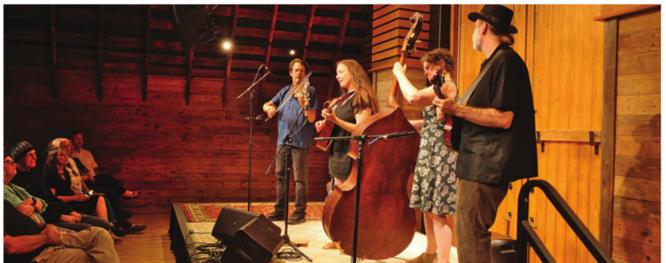
Awesome perks! Members received free admission to our July 15 concert with Furnace Mountain Band.