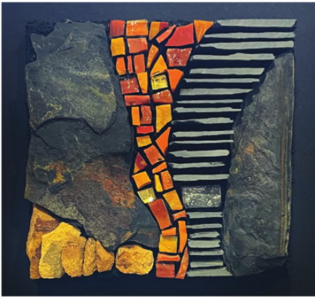
First-place winner in the “Berryville Celebrates” Juried Art Show 3D category, Orange Path by Christy Dunkle.

Our local art community delivered varied works in an array of media, from fiber art and photography to oil paintings and pencil drawings. This uniquely clever amalgamation—juxtaposing traditional landscapes with digitally rendered art, collages, stained glass, and quilts—successfully captured the diverse sense of creativity that permeates the town and county at the same time that it provided the artists an opportunity to share, display, and sell their work.