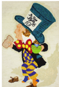
Alice’s Adventures in Wonderland hooked rug