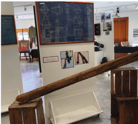
A section of wooden water pipe, unearthed by Berryville Public Works employees in 2014.