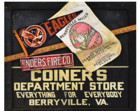
An assortment of Berryville memorabilia loaned to us for the "Berryville Celebrates" Historical Exhibit.

Although we were sad to see it go, our March Historical Exhibit was soon replaced by a Juried Art Show featuring the work of 30 Clarke County artists of all ages. Each artist was allowed to submit up to three original pieces for the consideration of the jury, made up of a representative from ShenArts, the Barns of Rose Hill Board of Directors, and the Town of Berryville.